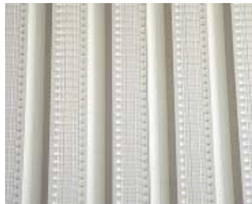
Bottom Right : View of reverse of Proair™