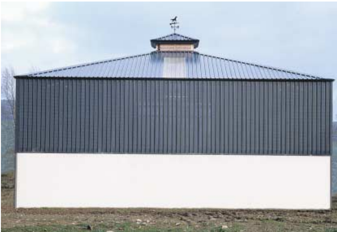
Middle : External view of Equestrian Centre.