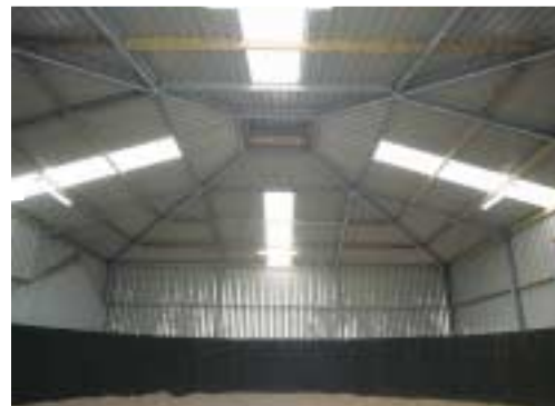
Bottom Right : Internal view of Equestrian Centre showing Proair™ sheet.