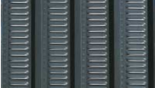
Left : Typical view of Proair™ sheet profile