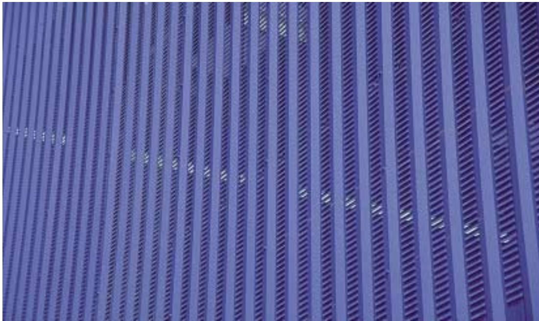
Middle : View of Building Duggan Steel (Irl.) Ltd., showing Proair™