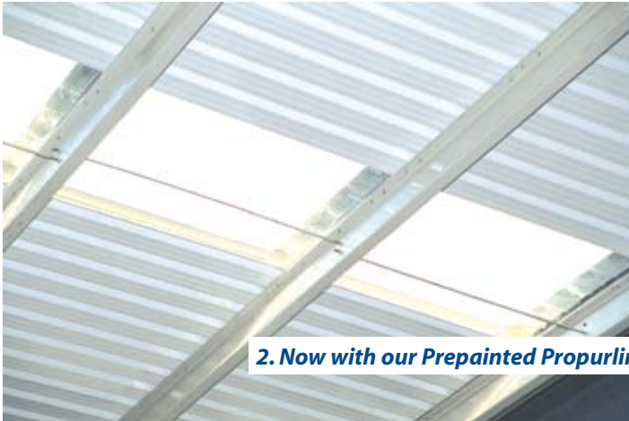
2. Now with our Prepainted Propurlin