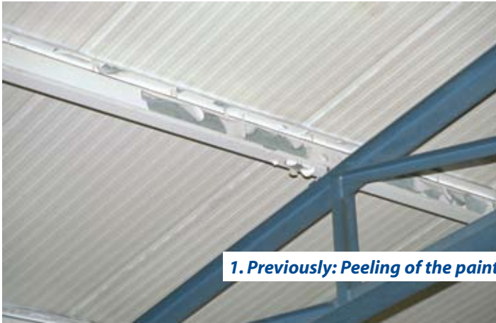
1. Previously: Peeling of the paint